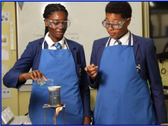
Students enjoying scientific discovery.