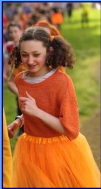
Year 7 Fun Run raising money for St Catherine's Hospice