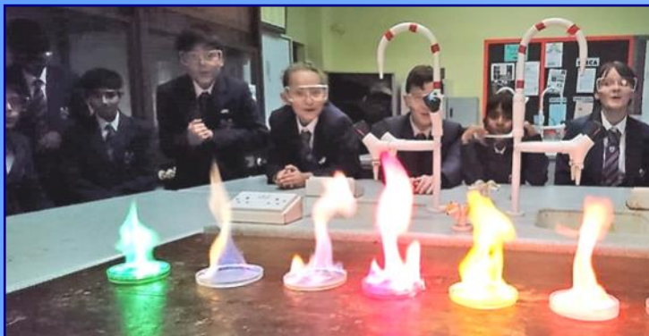
Students enjoying scientific discovery.