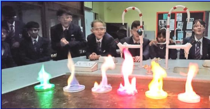
Students enjoying scientific discovery.