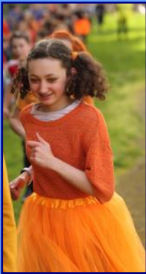
Year 7 Fun Run raising money for St Catherine's Hospice