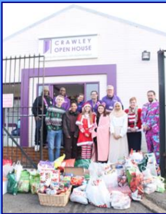
Donations collected for Crawley Open House in December